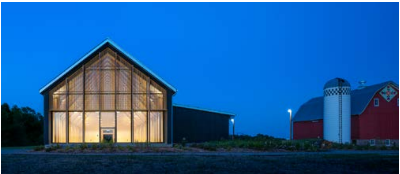
Minnesota Landscape Arboretum Tashjian Bee and Pollinator Discovery Center AIA COTE Top Ten Award